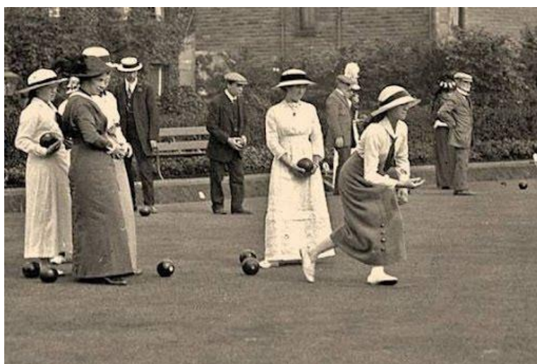
Last year's finals day.